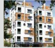
Jains PCH Elite, P.G. Road - Secunderabad.