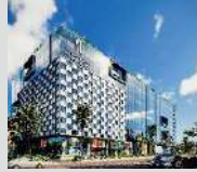
Jains Sadguru Images Capital Park - Hi-Tech City