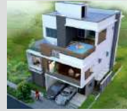
Jains Four Seasons Kokapet.