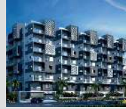
Jains Ravi-Gayathri Heights Shilparamam.