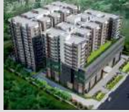
Sri Ram Gardens By Jains - Suchitra