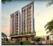
Amare By Jains Amalok Abids