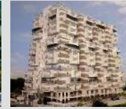
Jains Sadguru Heights Madinaguda.