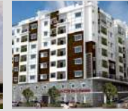
Jains PCH Rock Garden I, II & III, Madhapur